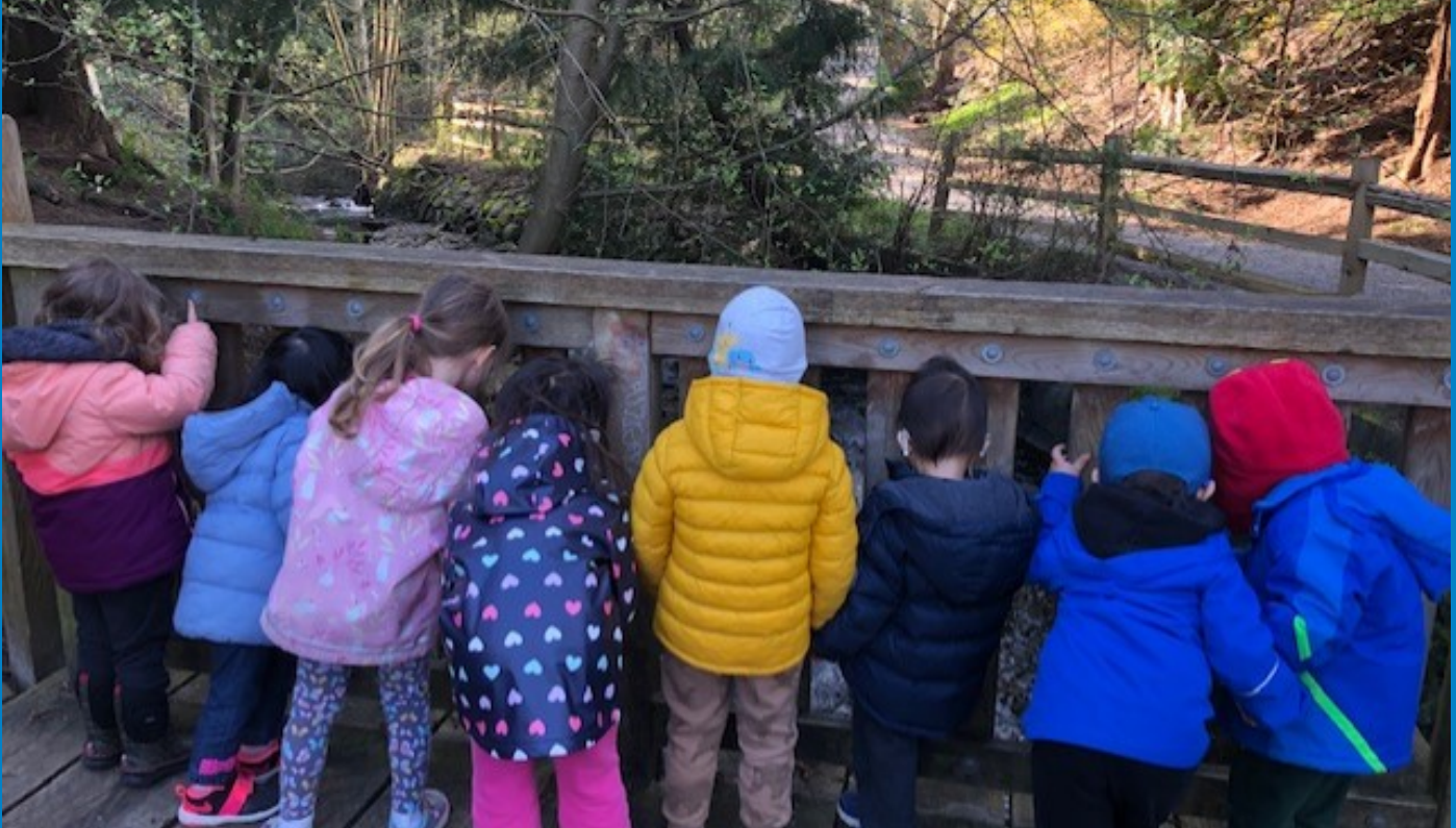
"Exploring Nature Around Us"